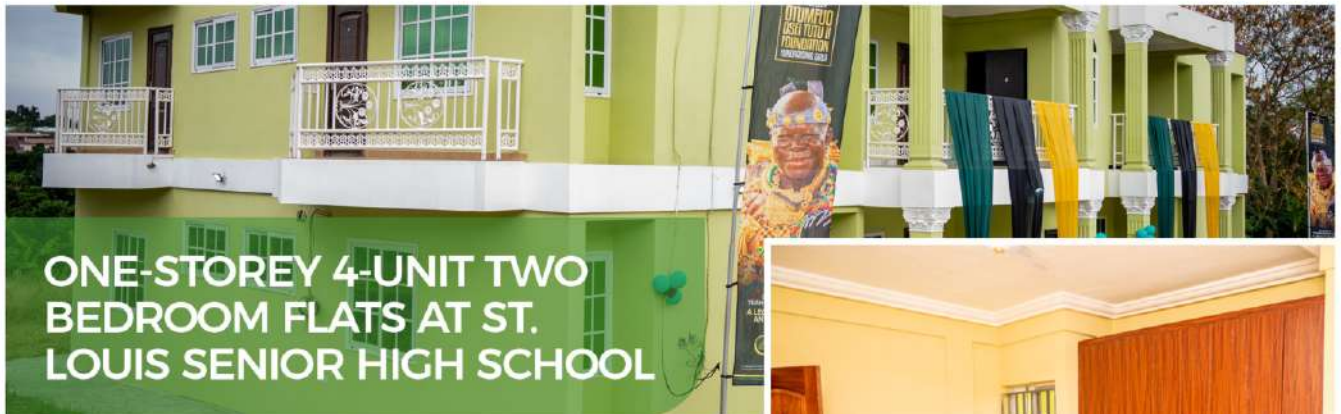
ONE-STOREY 4-UNIT TWO BEDROOM FLATS AT ST. LOUIS SENIOR HIGH SCHOOL

The Foundation is pleased to announce the completion and handover of a new staff bungalow to the school. With a student population of over 5,500 and 229 teaching staff, only 30 teachers currently reside on campus. The new bungalow therefore provides a major relief, offering much-needed accommodation for staff.